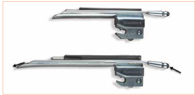
Figure 3. Dual-Use Laryngoscope Blade

The empirical evidence supports the efficacy of AO in delaying desaturation and prolonging the safe apnea period in adults. Another technique for providing AO is with a dual-use laryngoscope blade. The Miller Port American Profile Conventional Blade (SunMed LLC) has an internal lumen built inside the blade and allows for the noninvasive insufflation of O_2 when laryngoscopy is performed (Figure 3). The Naso-Flo nasopharyngeal airway (Medis Medical Co Ltd) is another alternative, which features an O_2 port and allows for O_2 delivery directly to the pharynx (Figure 4).