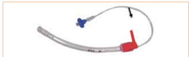
Figure 4. Nasopharyngeal Airway Device

Arrows indicate inflow and outflow of oxygen through the Miller Port American Profile Conventional Blade (SunMed LLC).